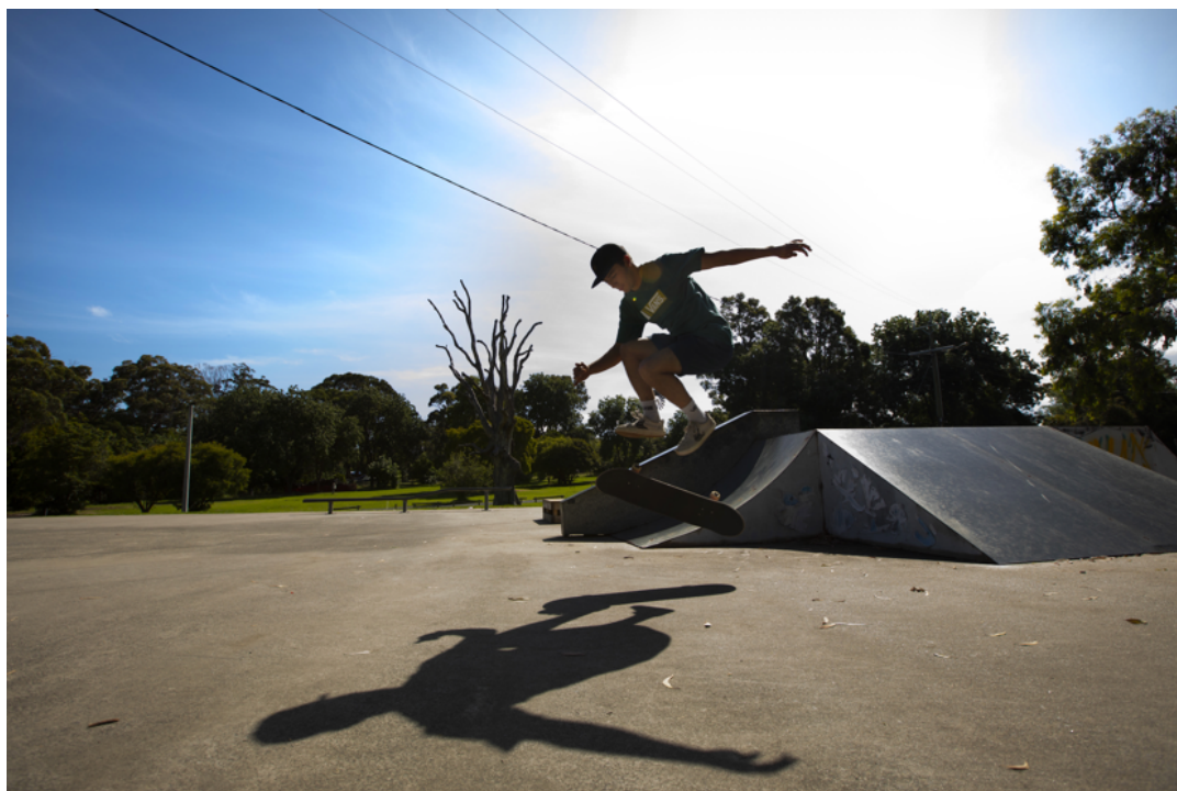
Mallacoota skate park gets an upgrade thanks to the advocacy of Mallacoota youth

"The importance of volunteering is very important to all things going forward. Do not leave it to few."