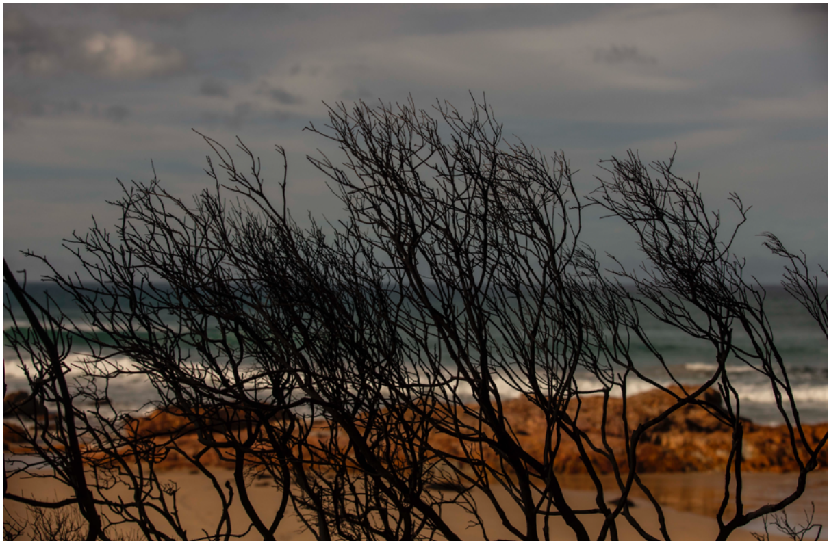
Bastion Point, Mallacoota

"All projects need to be implemented with their impacts on climate change taken into consideration. Taking action to reduce carbon emissions is more important in the long term than cutting down trees to reduce fire risks."