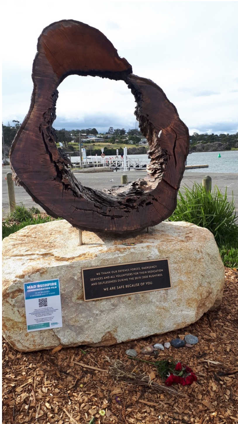
Commemorative log placed at the Mallacoota Wharf to honour fire fighters and the community