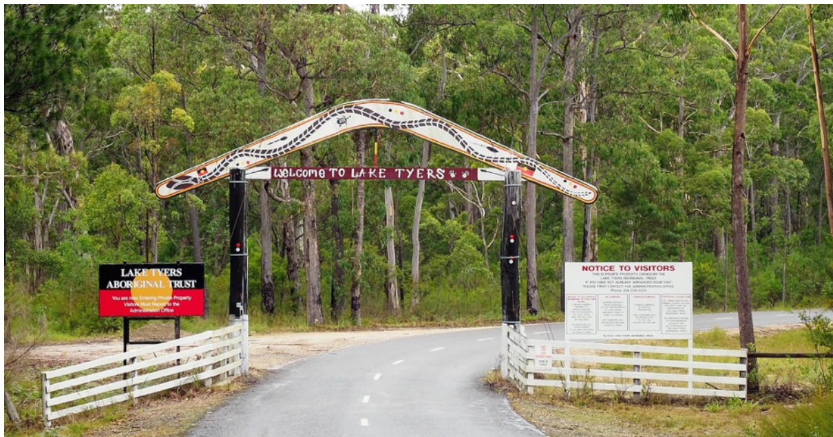
Lake Tyres Aboriginal Trust

"Being mindful and inclusive of our First Nation peoples' knowledge on the environment and their understandings of the original flora/vegetation in the areas plus their knowledge and sharing that knowledge on traditional burning is fundamental in our recovery."