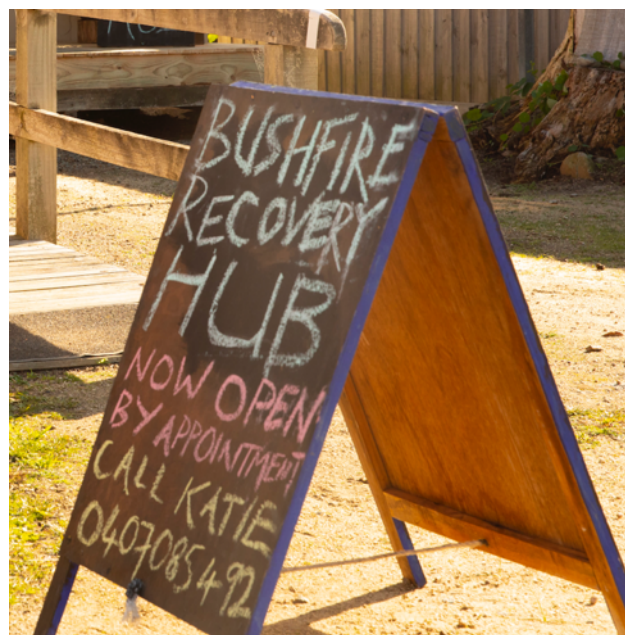
The Mallacoota and Districts Bushfire Recovery Hub

Establishing collaborative protocols and partnerships (3A) was the fourth ranked project. Comments reflect how important respondents consider this project.