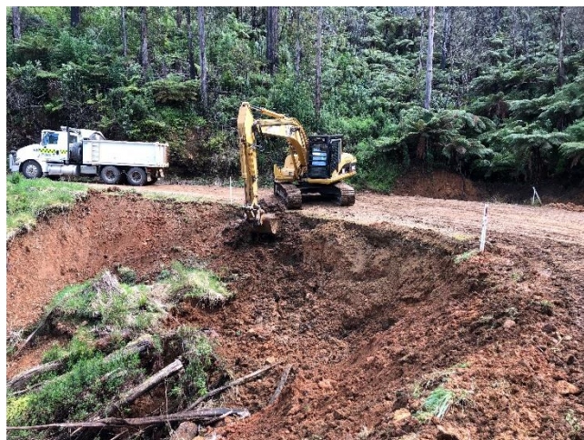
Marlo State Forest Walking Track – Non burn fuel treatment – before improvements