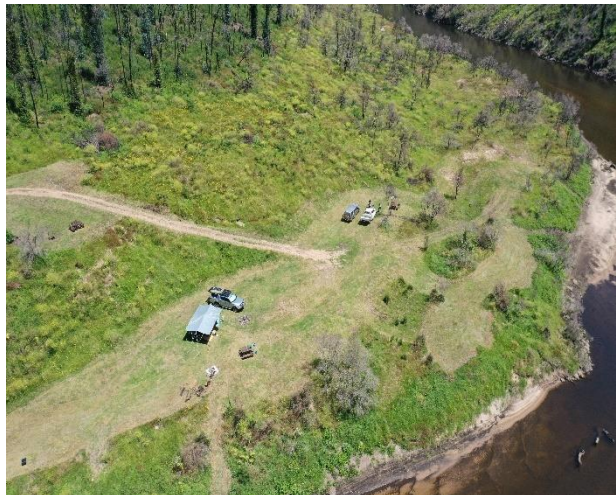
Sandy Point Campgrounds - before improvements