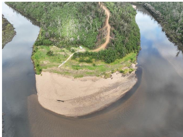
and after improvements