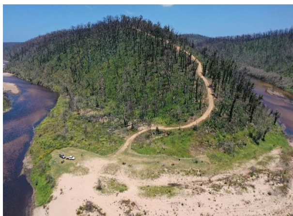
Long Point Campground - before improvements