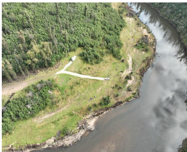
Long Point Campground - before improvements